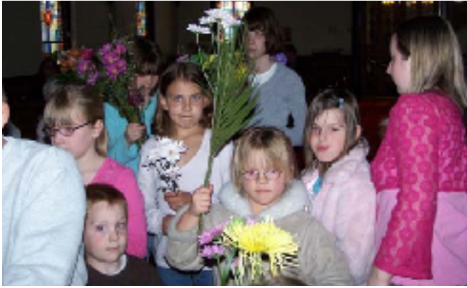
Kids flowering the cross Saturday before the egg hunt