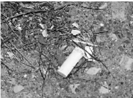
The garden volunteers are asking for everyone's help. Please do not drop trash or cigarette butts in the gardens.