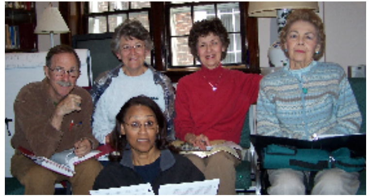
Education for Ministry class meeting in the library.